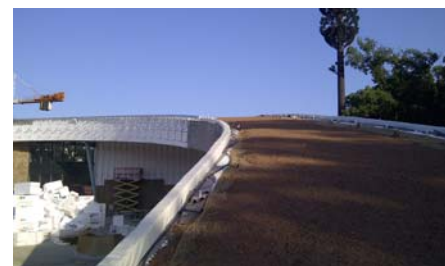
The system substrate suitable for lawn was applied in layer thickness of approx. 100 mm.