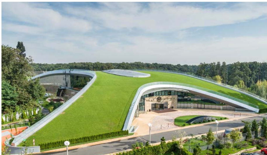
View of the cross-shaped green roof, which is now a component of the landscape.