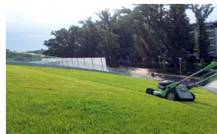
The green roof with its walkable lawn requires intensive maintenance including irrigation during dry periods.

tennis court or in the sauna. In order to integrate the mighty building into the landscape, the arched roof was completely covered with lawn. Various green roof systems were combined. Over the root resistant waterproofing Georaster ® elements were applied in the steeper areas, Floraset ® FS 75 in the slightly steep areas and Floradrain ® FD 40-E in the flat roof area, each of these in combination with a system substrate specially mixed for lawn.