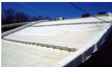
Shear retainers of the type Shear-Fix LF 300 and Eaves Profiles TRP 140 were installed in the steep roof areas in order to derive shear forces into the roof construction.