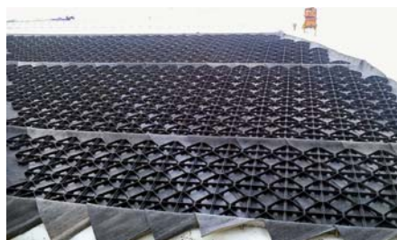
The synthetic Georaster ® elements, just before being filled with system substrate.