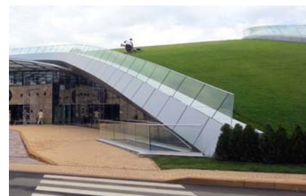
The greenery follows the roof shape down to the ground level and thus integrates the mighty building complex into the landscape.